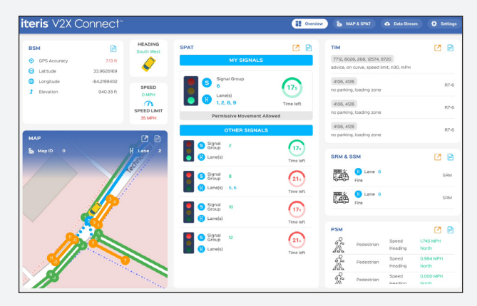
Intuitive and User-friendly

Connect to live Denso or Commsignia RSUs or analyze pre-recorded PCAP files.